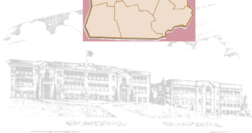
Laconia High School

Laconia High School is located in Laconia, New Hampshire, the County seat and in the heart of the Lakes Region. Laconia High School is home to almost 800 students, grades 9-12. The Laconia High School Theatre Arts Program, one of the school’s many co-curricular