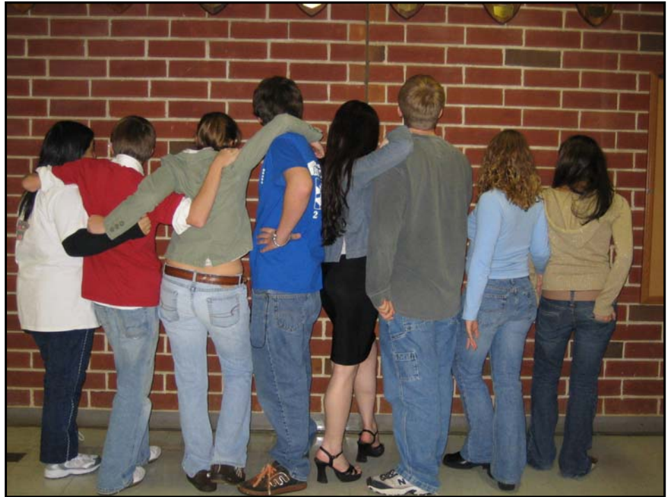
Students as they appeared on the back cover of the “Viewpoints” CD