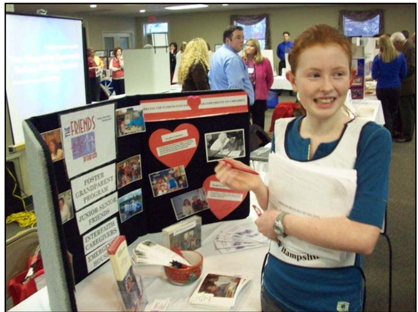
A youth invites visitors to view the numerous exhibits from agencies and organizations as part of the Exhibitor Showcase, a popular part of every Convocation event.

LACONIA: Children and youth from around Belknap County played a central role in the 5 th annual Belknap County Convocation on Children and Families held on Tuesday, January 22 nd from 3:30-7:30pm at the Opechee Inn & Conference Center in Lakeport. Along with the popular Exhibitor Showcase offered by organizations and agencies serving children, youth, and families in Belknap County, youth shared their projects, thoughts, and ideas about the communities where they live.