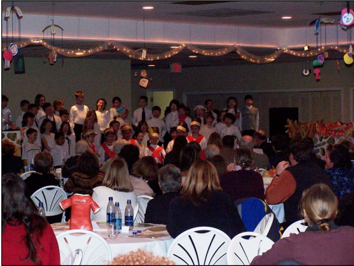
BELOW: Second graders from Gilford Elementary School end the Convocation event with a rousing presentation of the operetta, "Stone Soup: A Rock Opera". This is the simple story of how a village fed everyone through the small contributions of everyone.