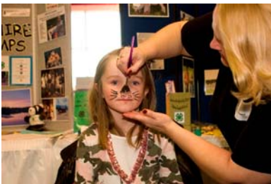
Face Painting at Exhibits