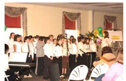
Belmont Elementary Chorus