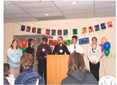
Student Emcess - Makin' Us Proud