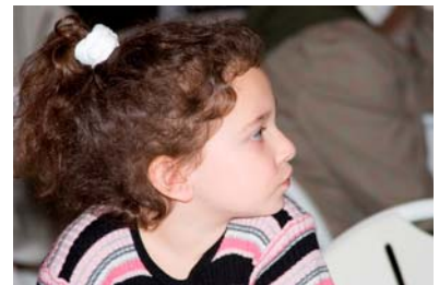
"I'm so glad I came"